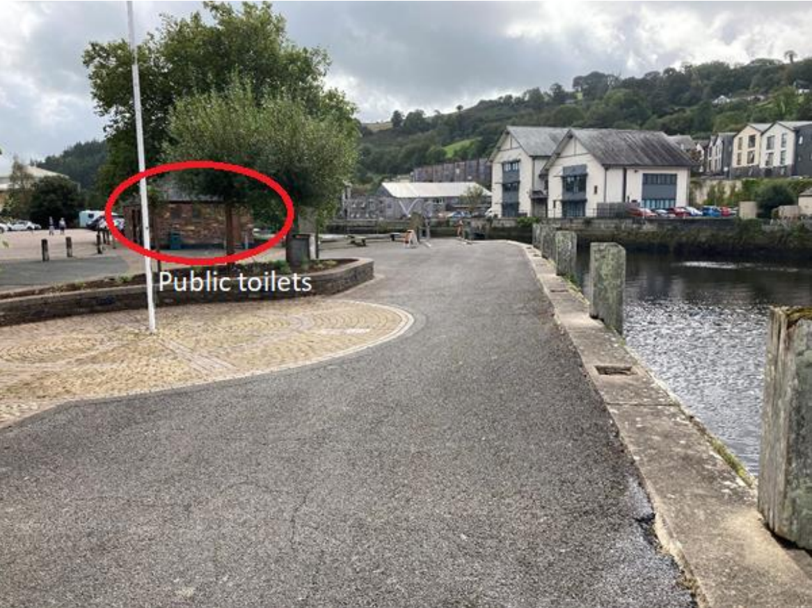
Public toilets to the south of the premises