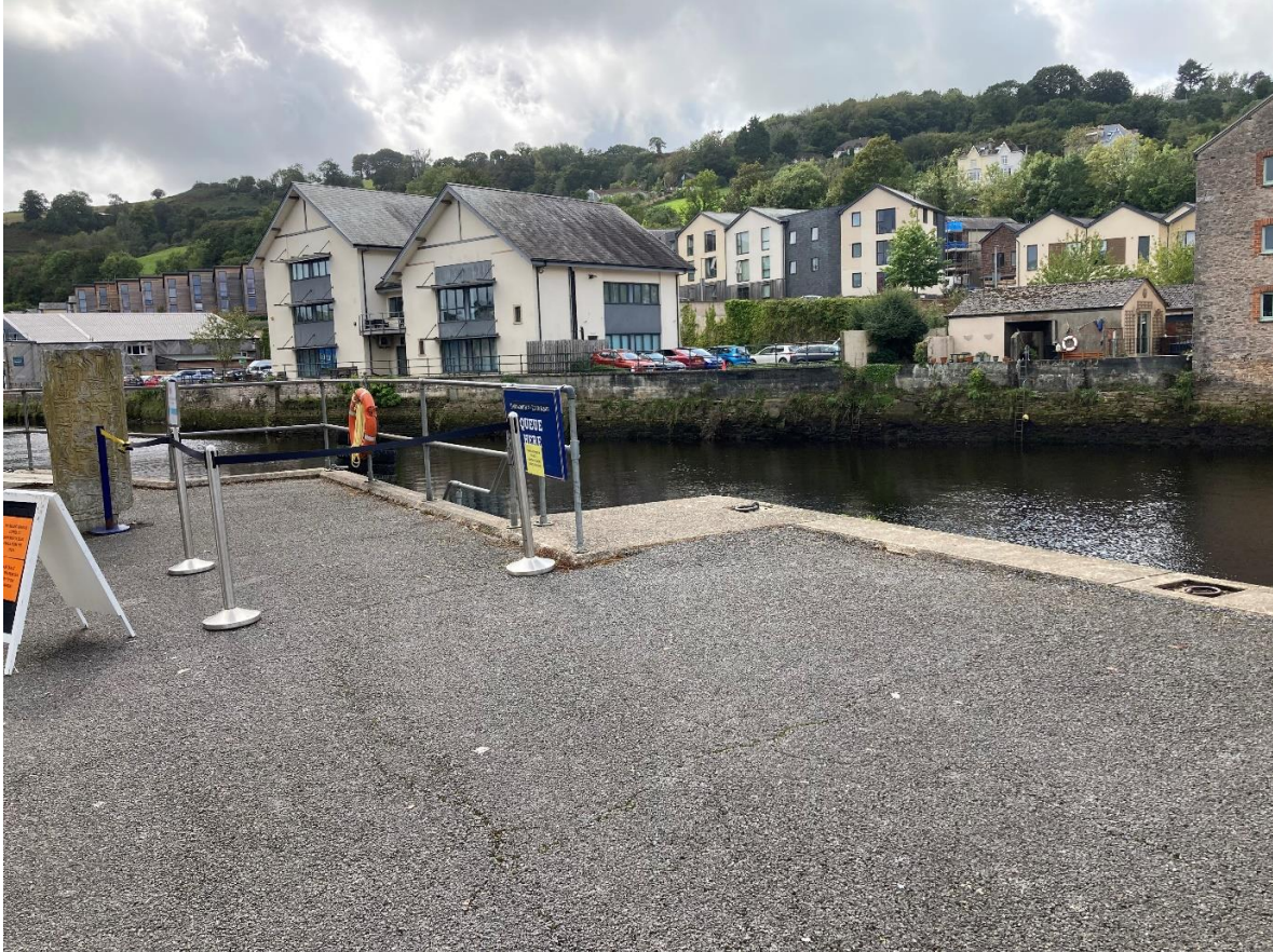
Steps where passengers board riverboats