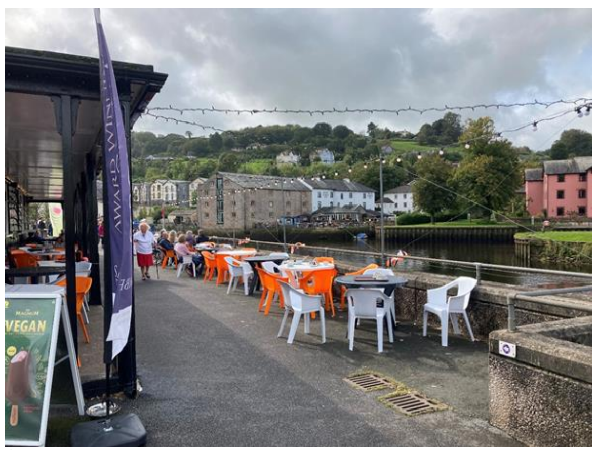
Outside seating area