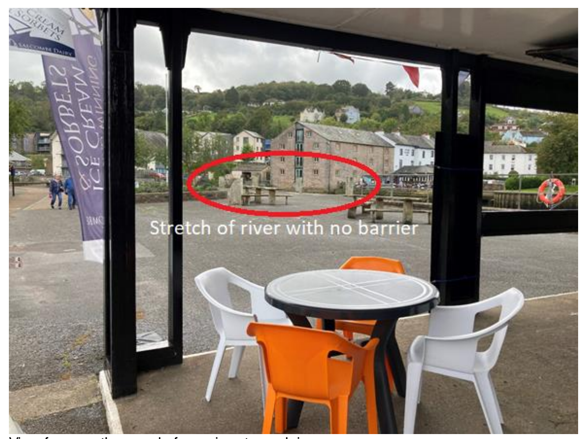
View from southern end of premises toward river