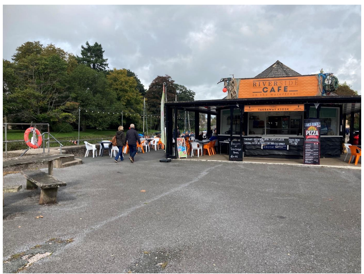
Southern end of premises