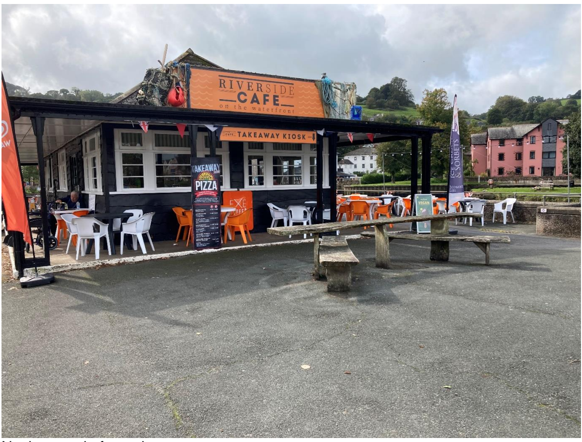
Northern end of premises